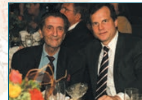
Long-time friend and colleague Bill Paxton attended the 2007 Walk of Western Stars ceremony to present Stanton with his award.