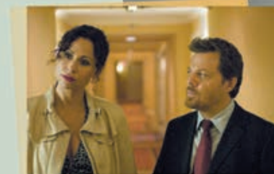
Minnie Driver and Eddie Izzard star in FX's hit drama "The Riches," pictured here on location at Hyatt Valencia in Santa Clarita.