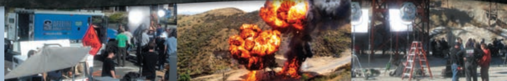
Santa Clarita is a favored location for many of the industry's top programs. Pictured left to right is "Las Vegas" at the intersection of Centre Pointe Parkway and Ruether; "The Unit" on location at the Bermite property; and "Heroes" at the City's Soledad Mine property.