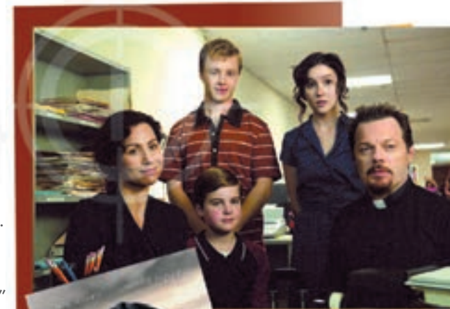
FX Network's hit drama "The Riches" starring Eddie Izzard and Minnie Driver is based in Santa Clarita and regularly films on location in the Santa Clarita Valley.

"The Riches" pilot episode was shot in Louisiana, but the rest of the filming took place on two permanent sets at Santa Clarita Studios and on location in and around the Santa Clarita and San Fernando Valleys.