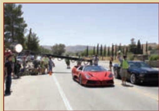
"Knight Rider's" location heavy storyline requires a film-friendly community like Santa Clarita.

Santa Clarita remains one of the most sought-after places to film in the Los Angeles area because the community remains film friendly and accommodating to productions like "Knight Rider" that base in the City. This is extremely important for a show that needs to frequently leave stages for location filming.