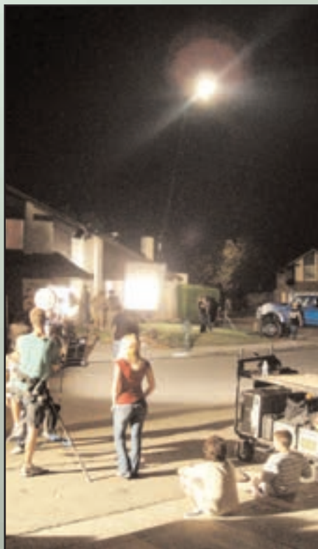
On location with the Polish Brothers' independent feature "Stay Cool", which was filmed in the Santa Clarita Valley. The "Stay Cool" locations team did its best to embrace its hero neighborhoods, bringing an ice cream parlor on wheels to several communities as a way to say thank you to the residents.