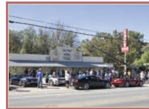
After 25 long years, "Knight Rider" returns to Santa Clarita.

But production was committed to keeping the show in California, which led them back to Santa Clarita, where the original series regularly filmed on location at Cal Arts in the 1980's.